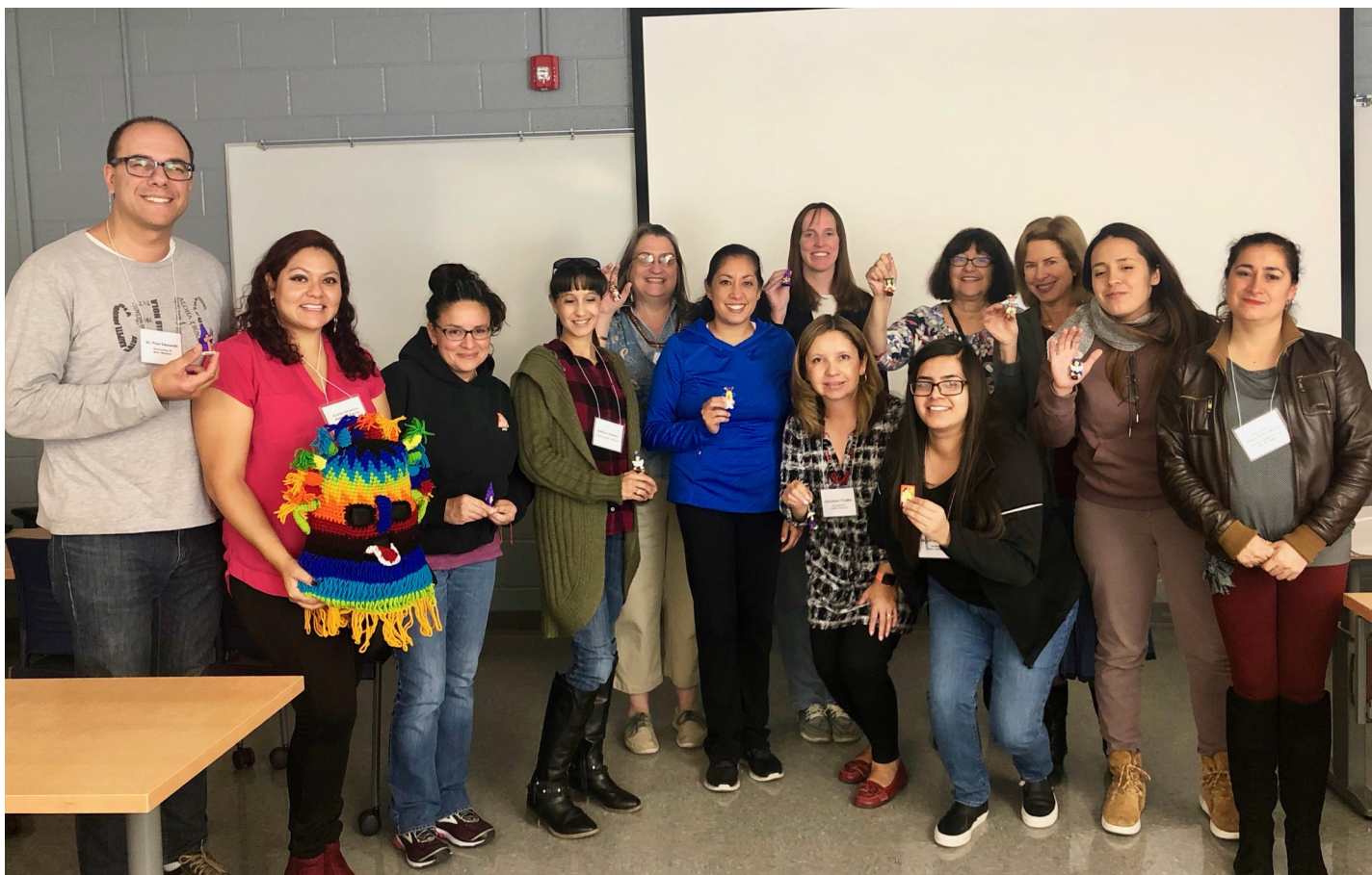
Attendees of the interactive presentation on Dictogloss by faculty from the Universidad Central del Ecuador.