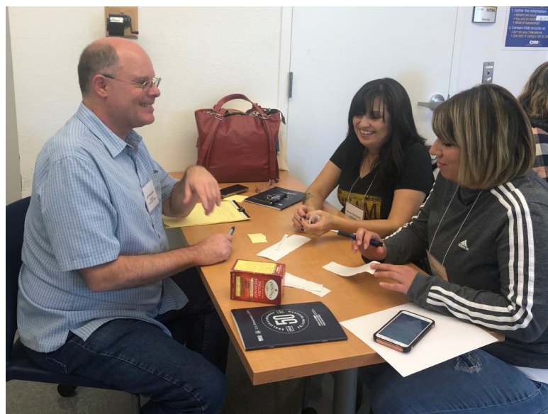
Attendees enjoyed access to 24 conference sessions.