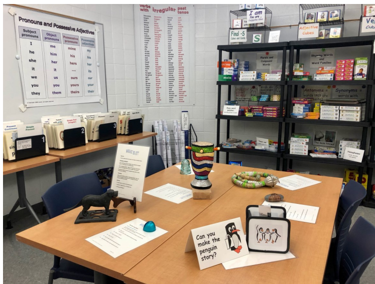
The PERC houses a wide range of teaching resources available for checkout.