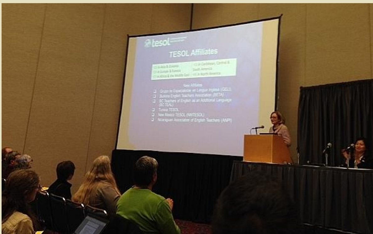
This photo, taken at the business meeting of TESOL International Association during the 2014 convention in Portland, shows NMTESOL is the fifth of six new affiliates.

Note: NMTESOL's affiliation with TESOL International does not give each of our members an individual membership with TESOL International. However, we urge you to join TESOL International because of the many benefits to individual members. As an individual member, you can take advantage of professional development seminars and webinars, access the newsletter and journal, receive updates and announcements, access lesson plans and join a conversation with your colleagues throughout the world through the special interest blogs.