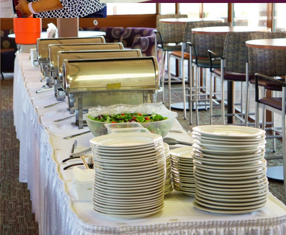
Lunch time! SFCC provided us with a delicious catered lunch.