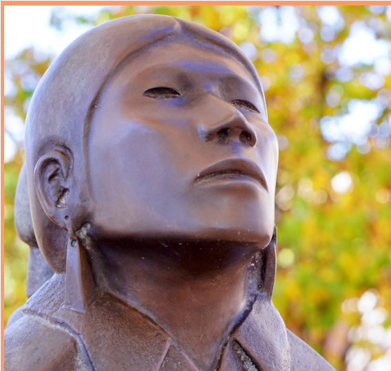
The art on the campus of SFCC is stunning. "Raindrops" by Allan Houser.