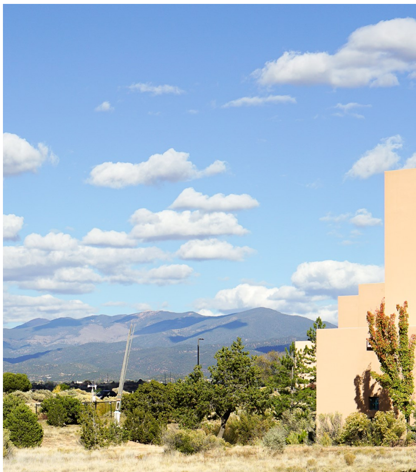
Santa Fe Community College, October 2016.

NMTESOL's Annual Membership Meeting is coming up! Keep your eyes on your inbox, we'll be sending you a cordial invitation soon! We look forward to seeing you there.