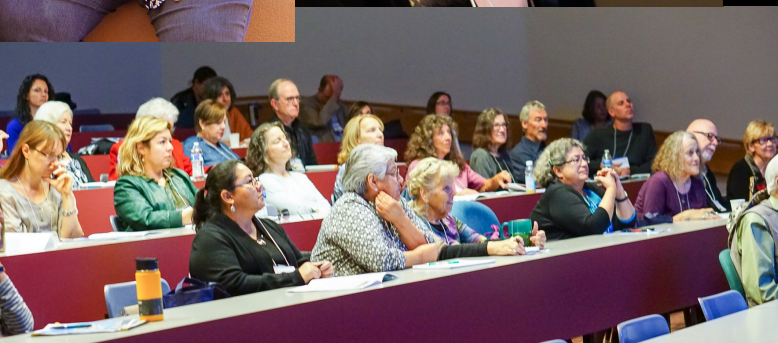
Good morning everyone!