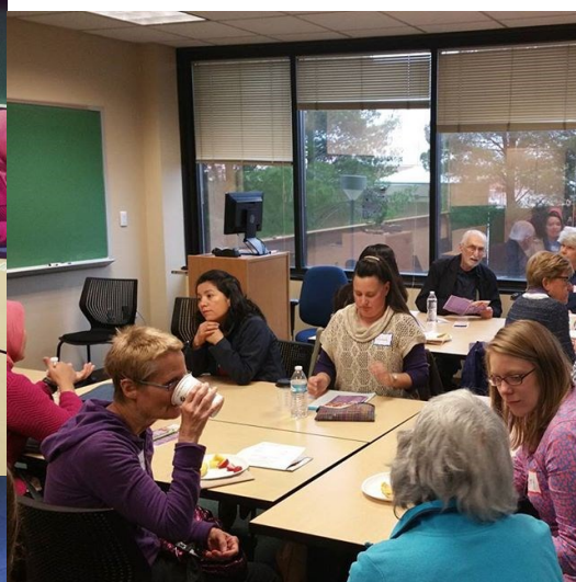
Networking Session. Good thing there's coffee at gam on a Saturday.