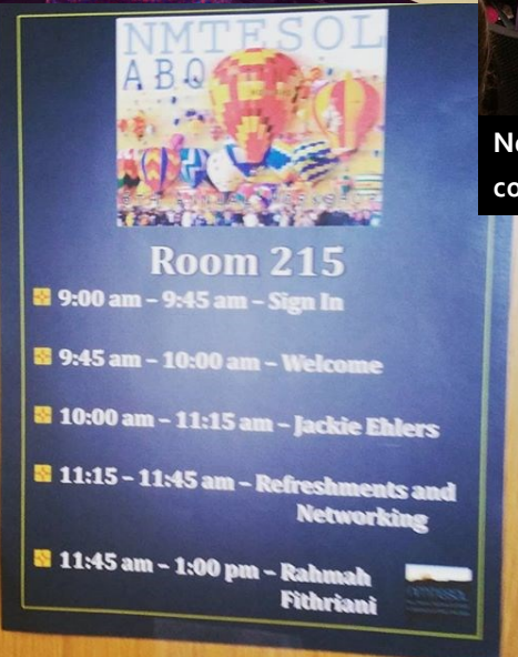
Getting started with opening remarks in 3 minutes!