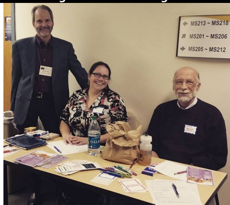
Board members staffing the registration table.