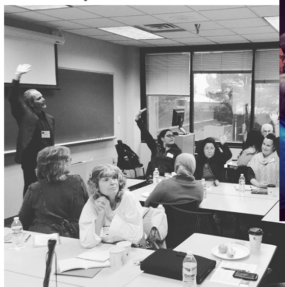
Welcoming remarks have begun!

One of the easiest way to share your pictures of our events with us is to tag or hashtag NMTESOL on Instagram! Our Web Coordinator, Melanie, posts updates and snapshots in real time at our events. Posting pictures of slideshows, hand-outs, and schedules is also a good way to share what you're learning. Enjoy some of the latest pictures from our feed below, and check out more on Instagram . Use #NMTESOL when you share!