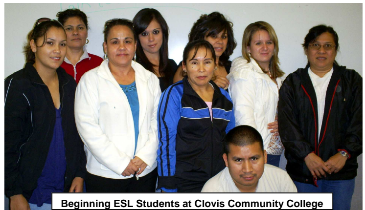
Beginning ESL Students at Clovis Community College