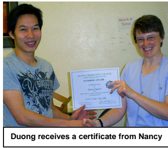
ESL classes are very exciting at Clovis Community College's Center for Student Success in Clovis, New Mexico!

Material submitted to the newsletter is primarily edited for space considerations. Ownership of any article published in this newsletter is retained by the author.